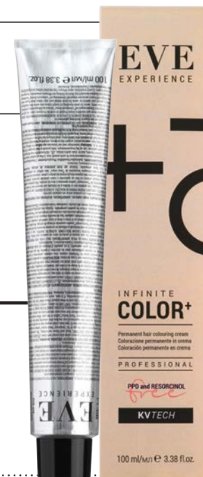
EVE Hair colouring cream 100 ml

* Instrumental lab tests (colorimetric data). Tested by independent laboratories. ** Although the formula is less sensitizing, there remains a risk of allergic reaction that can be severe. Always perform an allergy alert test 48h before each coloration. Strictly follow safety instructions on box.